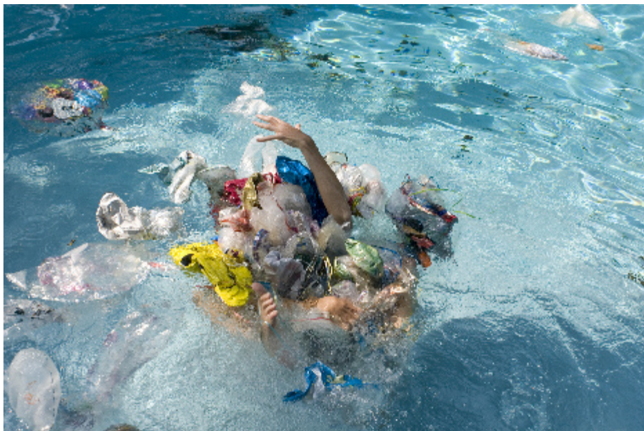
Swimming Lesson #1 , 2009, C-print, 18" x 27"